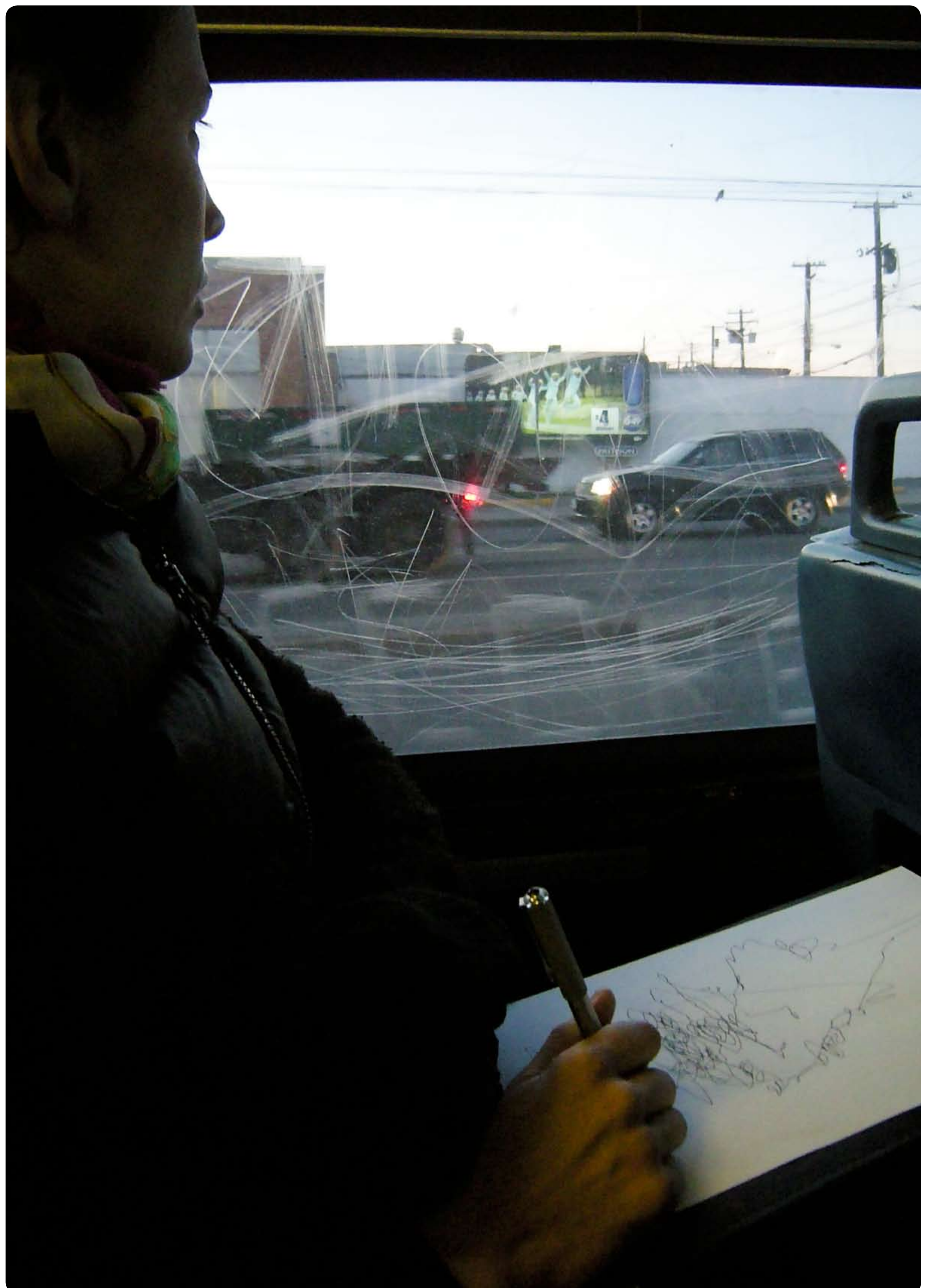
41 UBC, 7:41am (the fourth map).