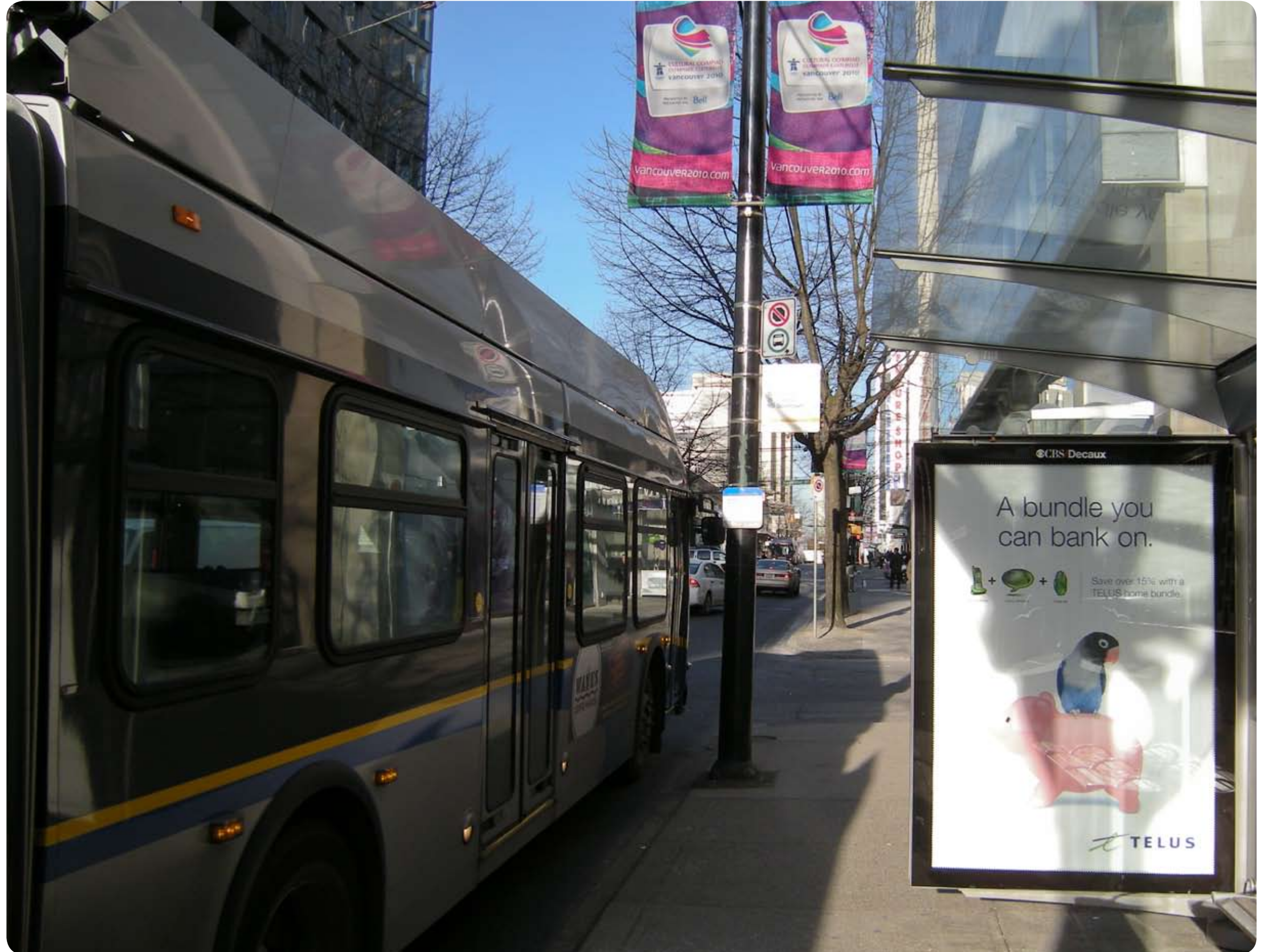
Bus stop, Robson and Richards, 9:40am.