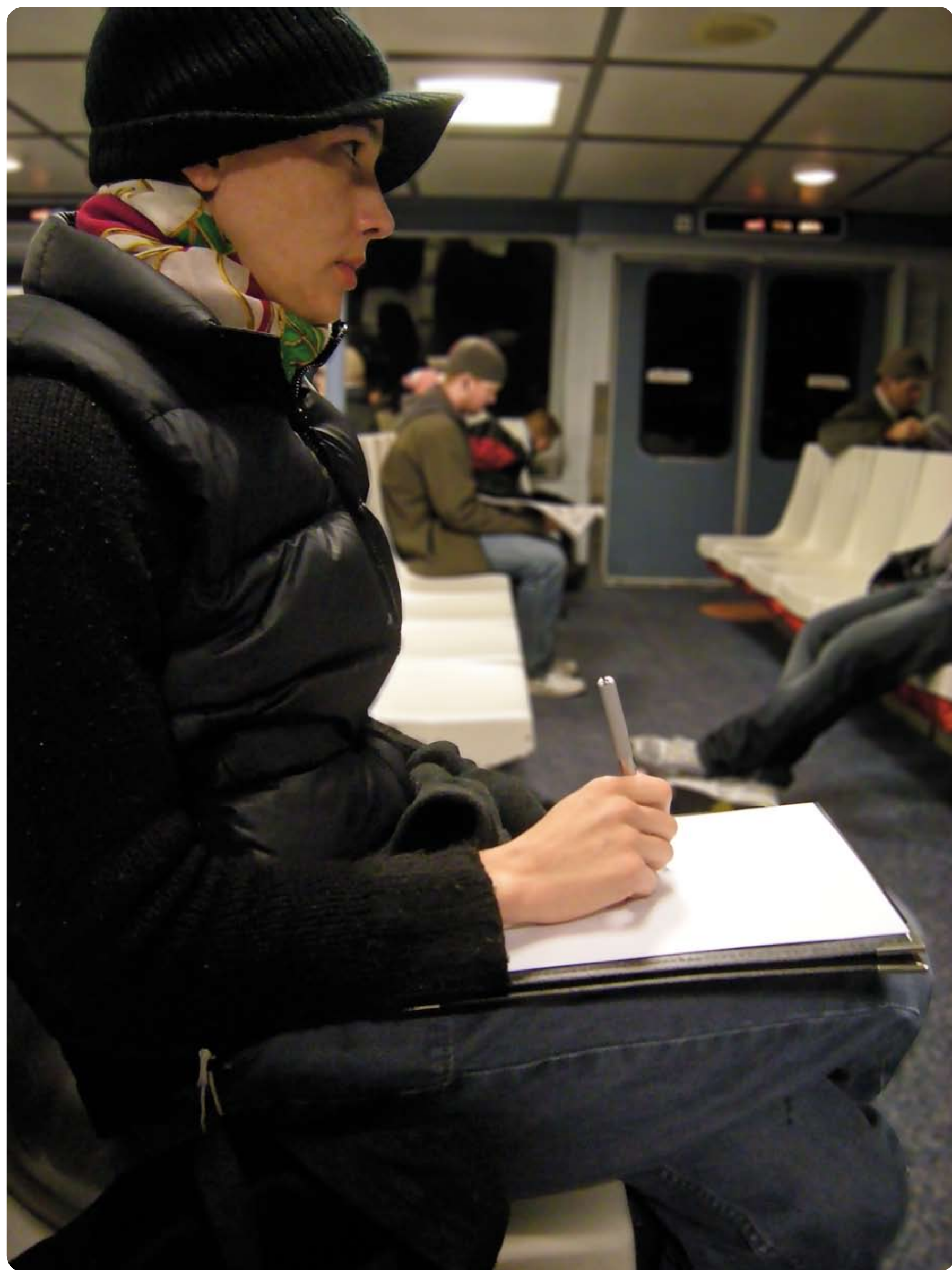
Seabus, 06:22am (the first map).

All photographs were taken by Juho Jäppinen. Jäppinen was also responsible for the note taking which is used in the construction of the map's legend, as well as for providing some moral support and encouragement during this marathon.