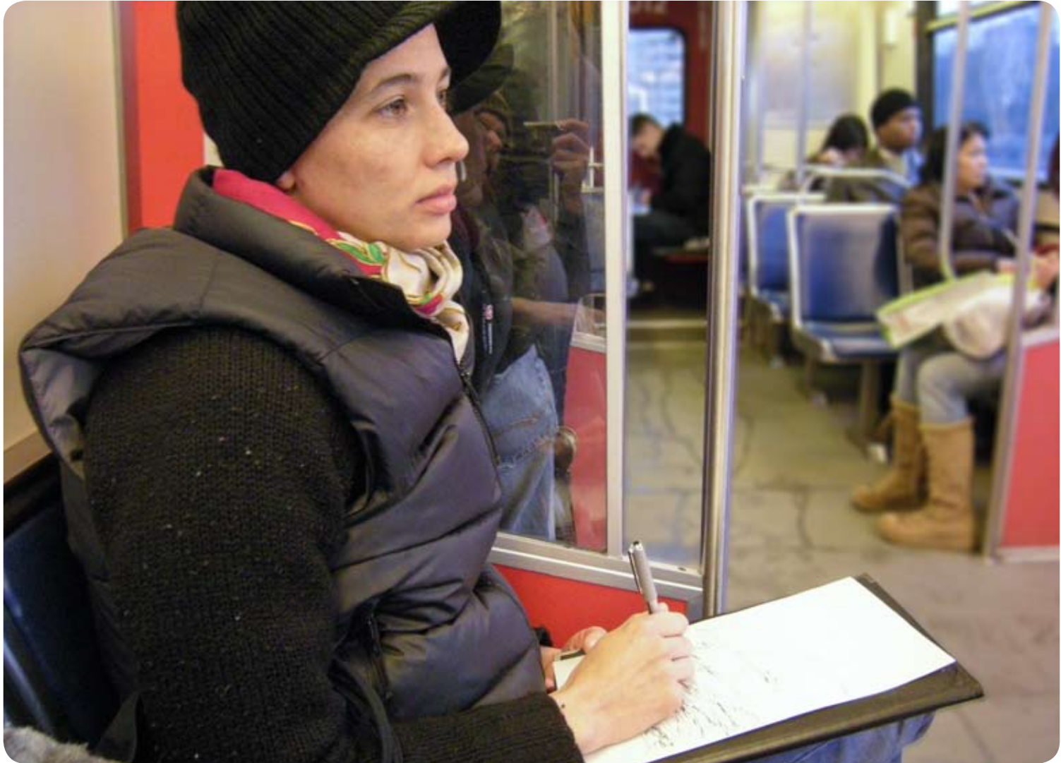
Millennium Line, 4:38pm.