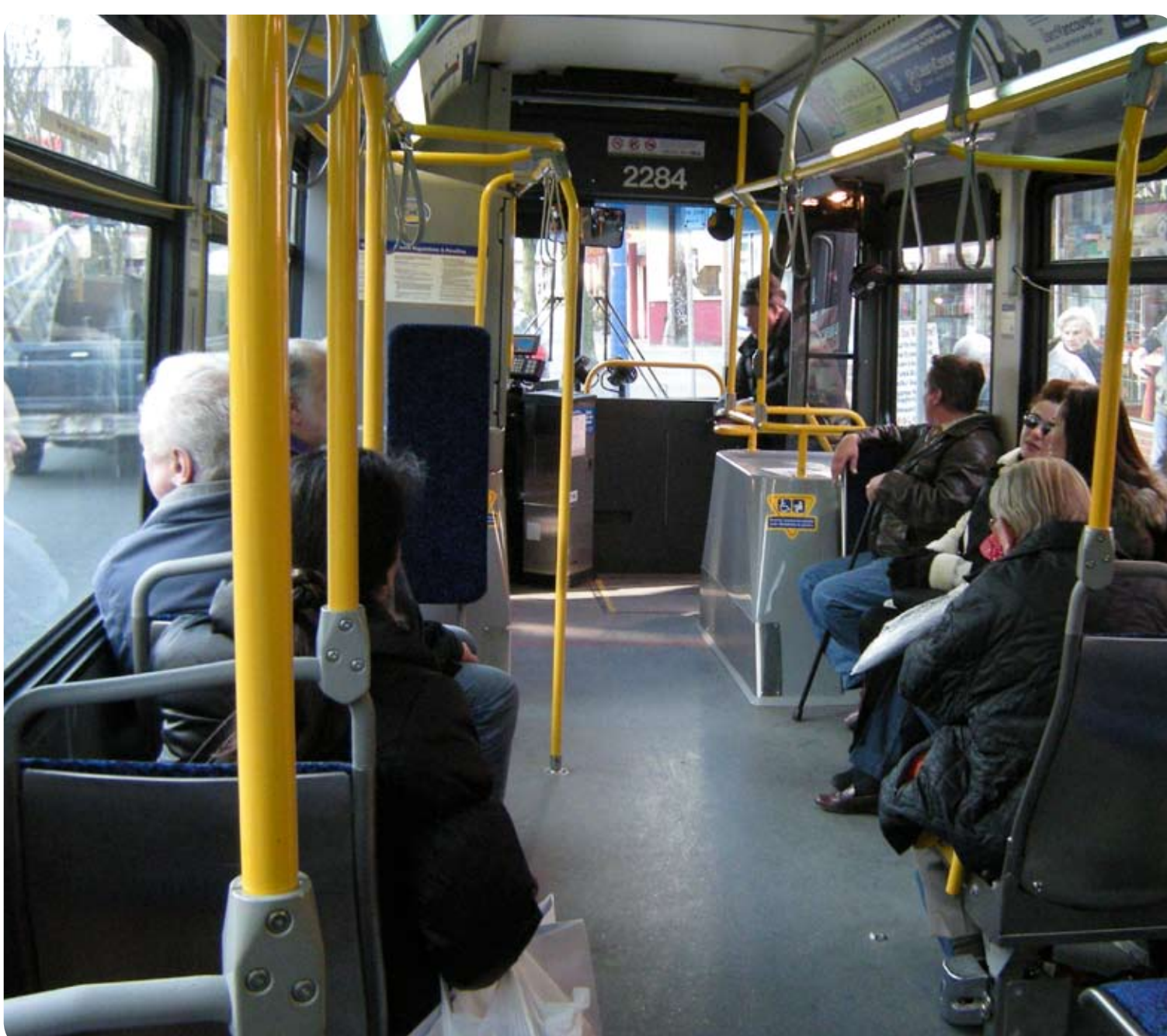
5 Robson, 10:16am.

Ruth and Jäppinen followed a tight, untested timetable which allowed an average of 5 minutes for transferring. On the project's realization day, all of the departure times differed from the predetermined schedule, breaks were taken at variance to the timetable, and technical problems led to a 20 minute delay. Regardless of these unexpected changes to the timetable, the arrival time was still within two minutes and 45 seconds of the estimate.